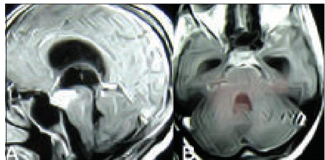
Fig.-1 : MRI of brain A-sagittal view, B-axial view showing tuberculus lesion in the floor of third ventricle.